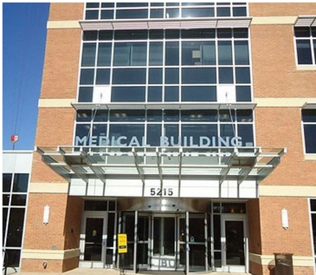
Building A Sibley Medical Building 5215 Loughboro Road, NW Washington, DC 20016

Two days of information is presented in a relaxed, professional atmosphere, delivered with humor and real life events that help you to relate the Recommended Practices to your own perianesthesia nursing practice. You will retain the information for the exam and for years to come.